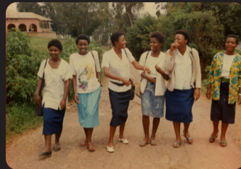
IGEGA VA À L'ÉCOLE