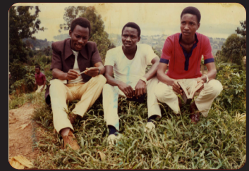
JULE ET FRÈRE