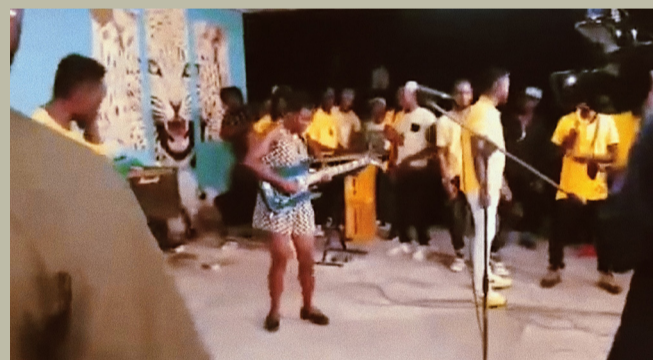
SOLO YA SARAH (on screen)