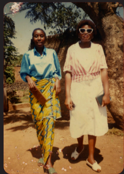
IGEGA EN BUT ROUTE