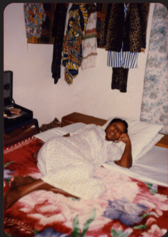
SEOUR EN CHRIST