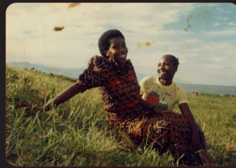
ECHO DE L'EVANGILE