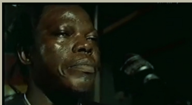
KILIO, YA REMMY ONGALA (on screen)